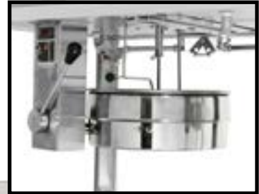
ANSUL Discharge Nozzles