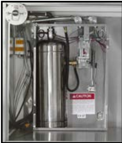
ANSUL canister inside base cabinet