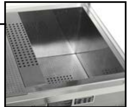
Bin Elevator (down)