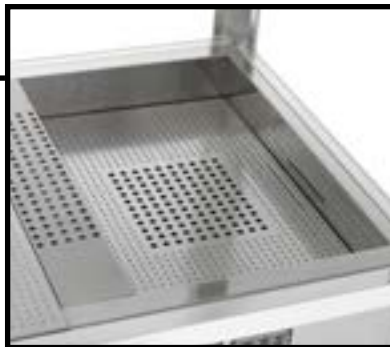
Bin Elevator (up)