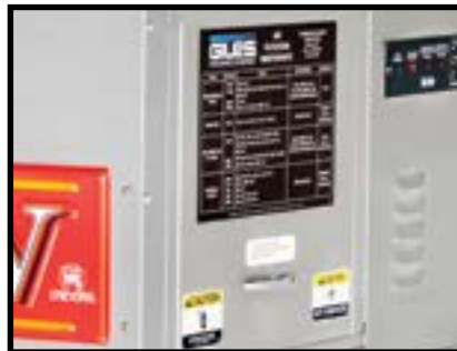
Close-up of Ventless Feature