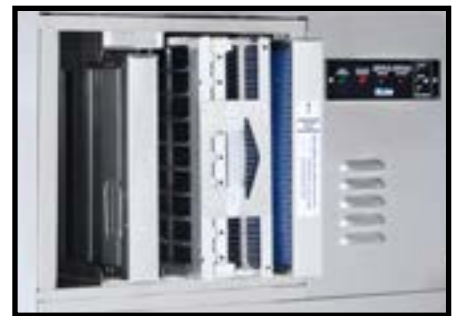
Ventless Filters • Baffle grease filter • Electrostatic filter • Polysorb filter

Contact your Cretors representative for a complete list of agency approvals for each machine. Images may not reflect current equipment modifications, features and accessories.