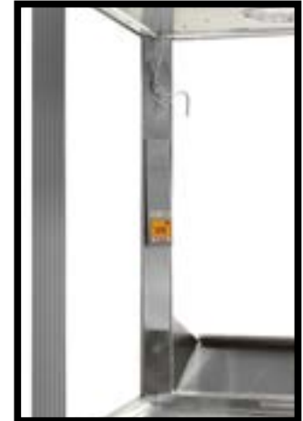
Popit N' Topit