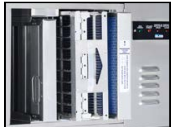
Ventless Hood System