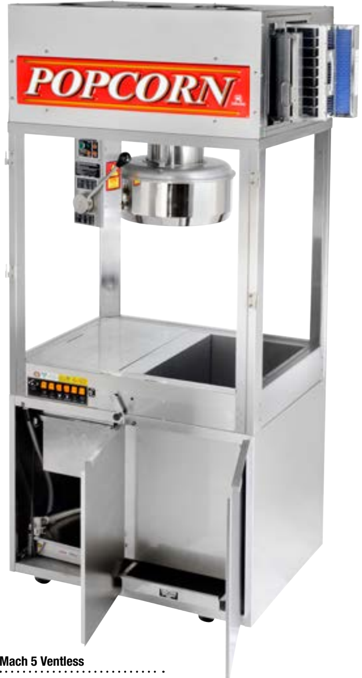
Mach 5 Ventless